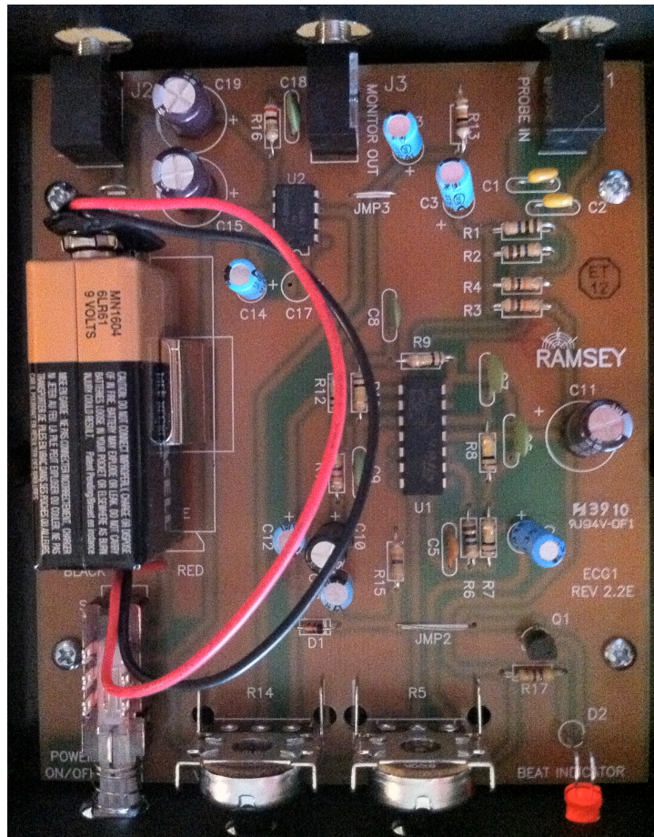
Figure 2. The circuitry used in the EKG